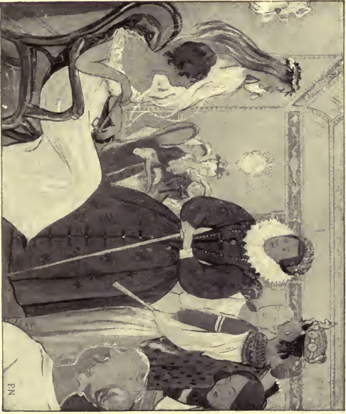
MADAME RÉCAMIÈRE HAS A PLAN